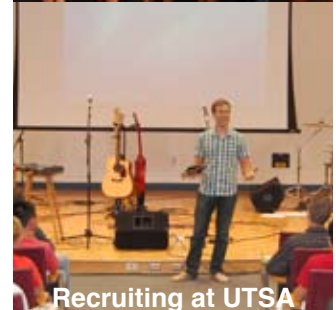
Recruiting at UTSA