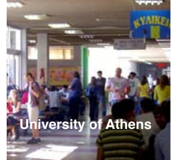
University of Athens