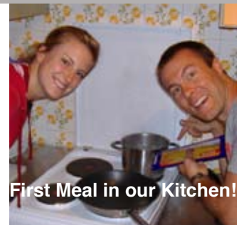
First Meal in our Kitchen!

Pray, Pray, Pray During the next month, we will be laying a crucial foundation for our ministry. Our team has finished the bare bones of our office/coffee house, and hope to be inviting students by November. Between now and then, we will be making as many Greek friends as we can, trying to find out where they feel a need for Christ. Please pray for us, and the students of both Athens University and Athens Polytechnic. We are so encouraged to know you are behind us praying.