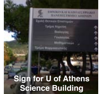
Sign for U of Athens Science Building