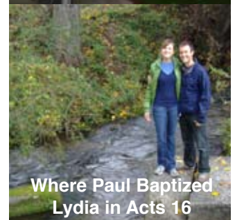
Where Paul Baptized Lydia in Acts 16