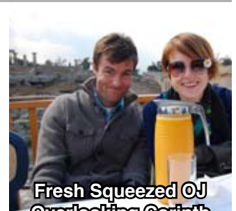
Fresh Squeezed OJ Overlooking Corinth