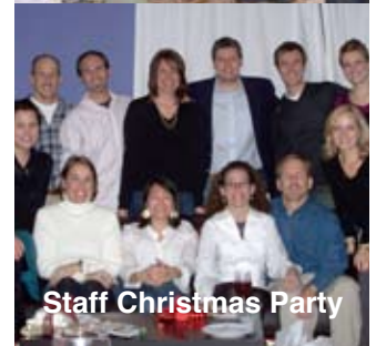
Staff Christmas Party