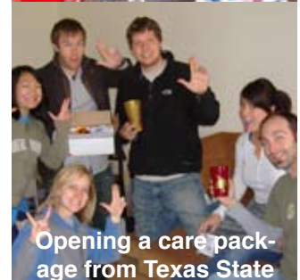
Opening a care package from Texas State